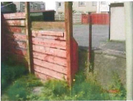
Rear garden fence - PHOTO 7