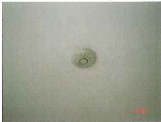
Upper floor landing – smoke alarm