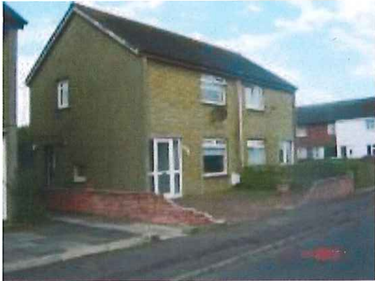
Front elevation and boundary walls