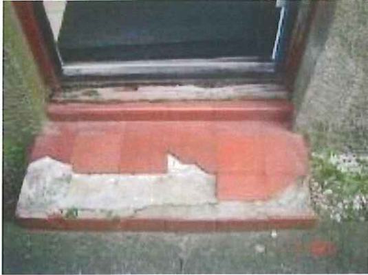
Ext step at kitchen door