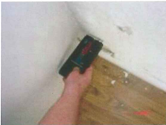
Damp reading-hall wall - PHOTO 19