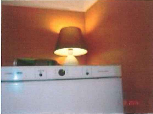
Light in kitchen