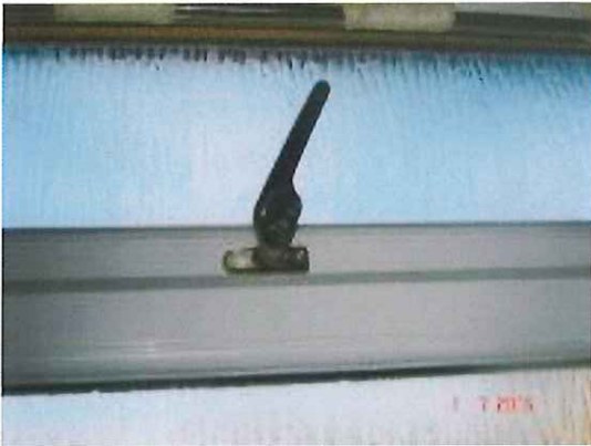
Bathroom window - PHOTO 31