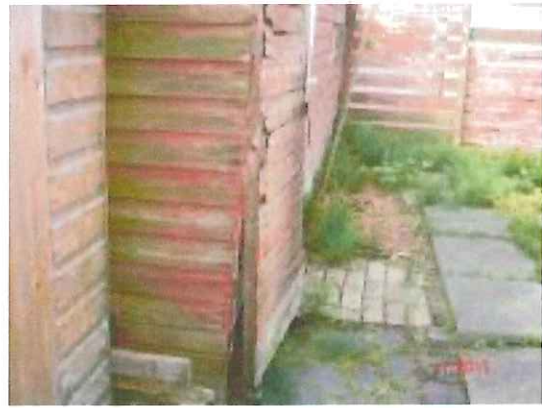
Garage wall - PHOTO - 8