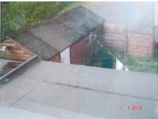
Rear ext roof/garage