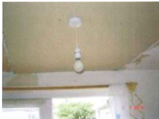
Ground floor bed ceiling - PHOTO 38