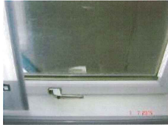
Upper Landing window - PHOTO 32