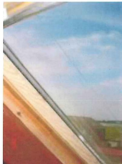
Velux window PHOTO 34