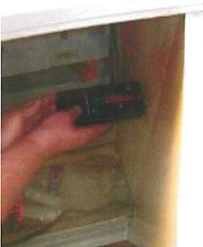
Damp reading - PHOTO 25