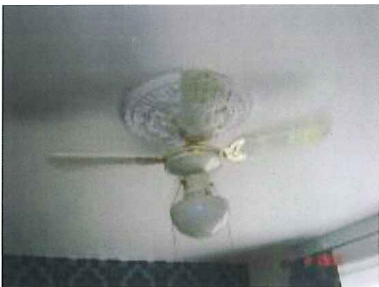
Living room-fan light - PHOTO 37