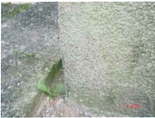
Render crack-gable/rear - PHOTO 13