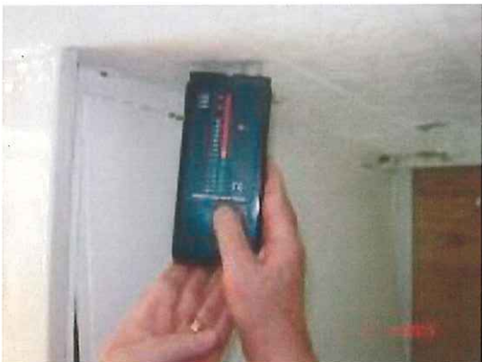
Damp reading-hall wall PHOTO 21