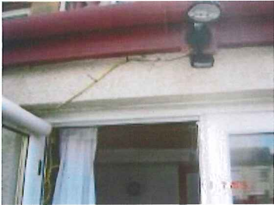
Light and wiring at extension