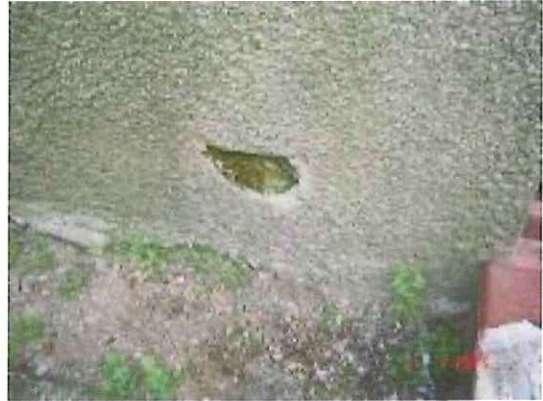
Defective render at gable