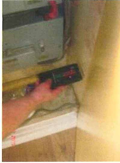
Damp reading in meter cpd