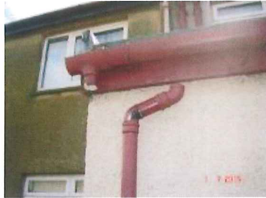
Gutter/downpipe at ext.