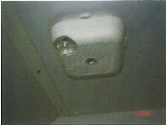
Attic smoke alarm