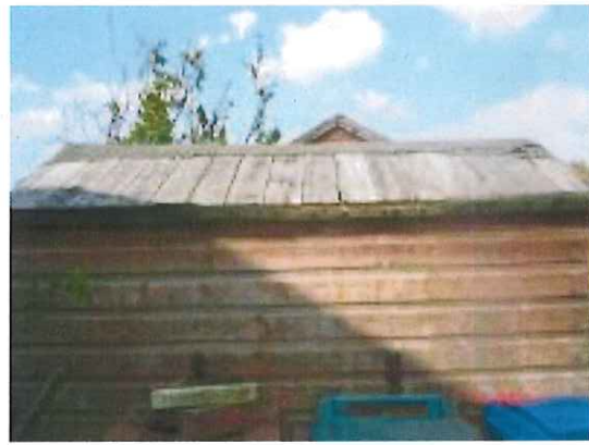
Shed - PHOTO 14