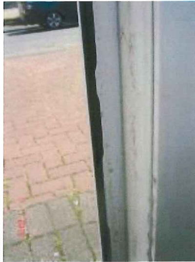
Front doorframe seal - PHOTO 26