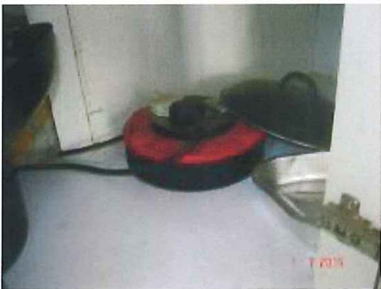
Cable extension in kitchen