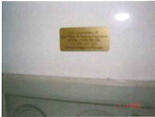
Gas boiler installer