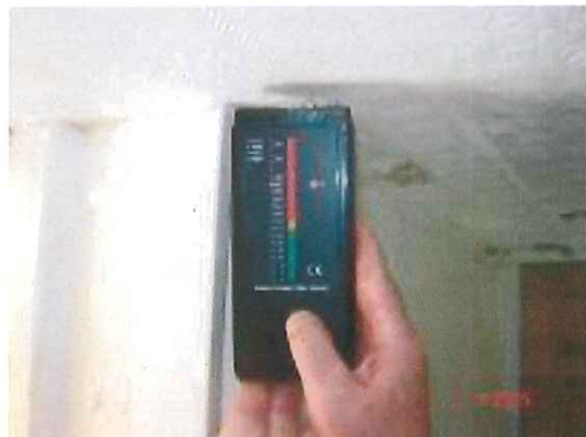
Damp reading-hall wall PHOTO 22