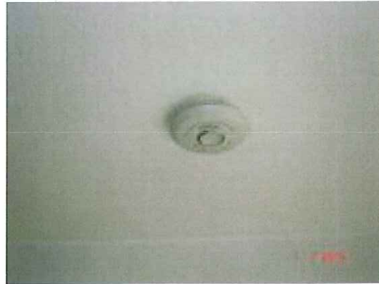
Ground floor hall - smoke alarm