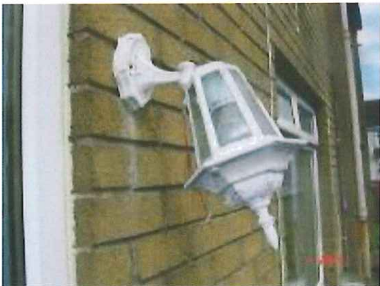
Wall light on front wall