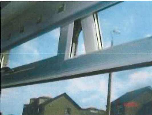
Living Room window