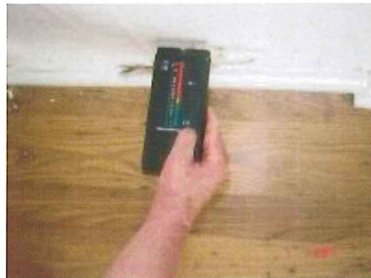
Damp reading-hall wall - PHOTO 20