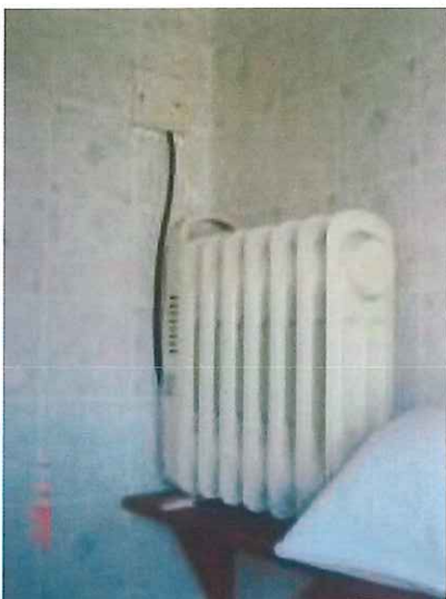
Bathroom-electric radiator PHOTO 33.