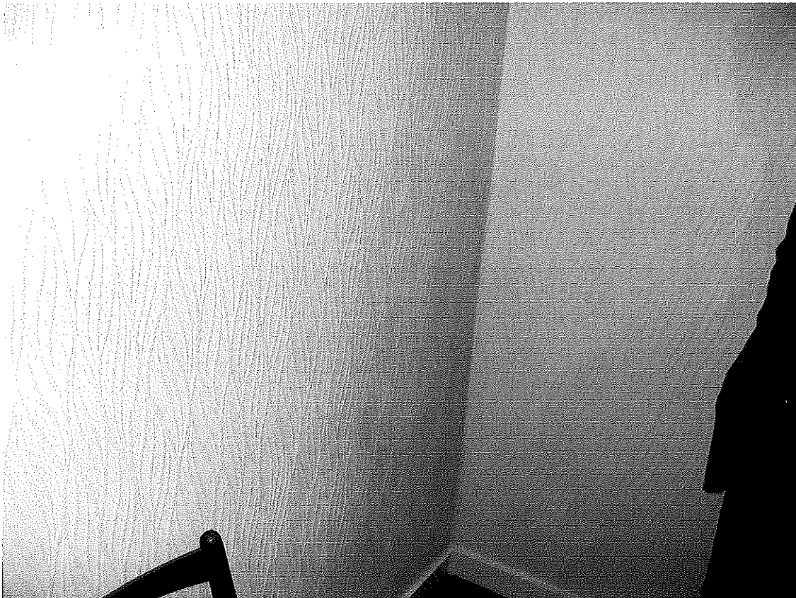
03 - Dampness - rear bedroom at stairwell (left) & gable wall