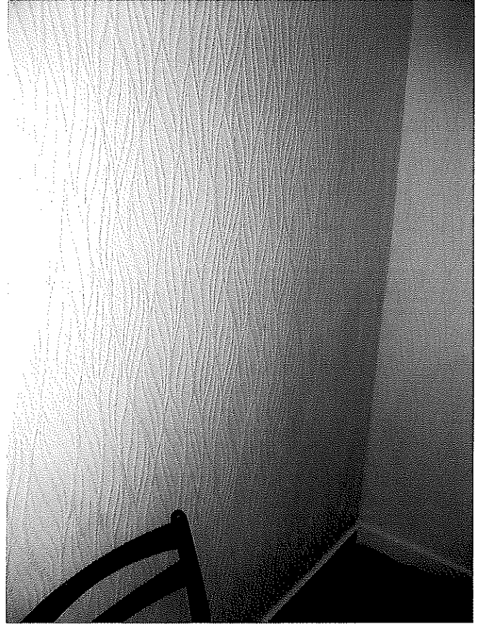
01 - Dampness - front bedroom (stairwell right) 02 - Dampness - rear bedroom (stairwell left)