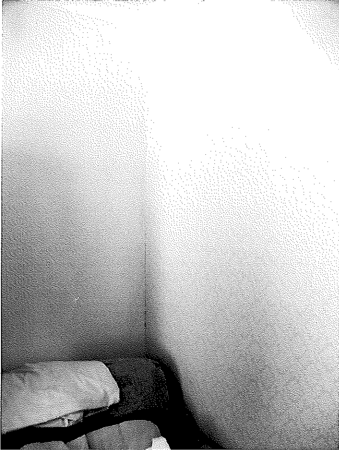
01 – front bedroom (stairwell right)

Photographs taken on re-inspection at 9 Weston Ave., Annbank KA6 5EE on 18 August 2015