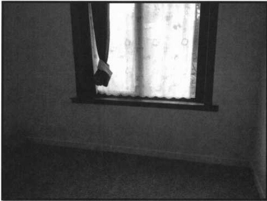
Figure 5 Rear Bedroom wall