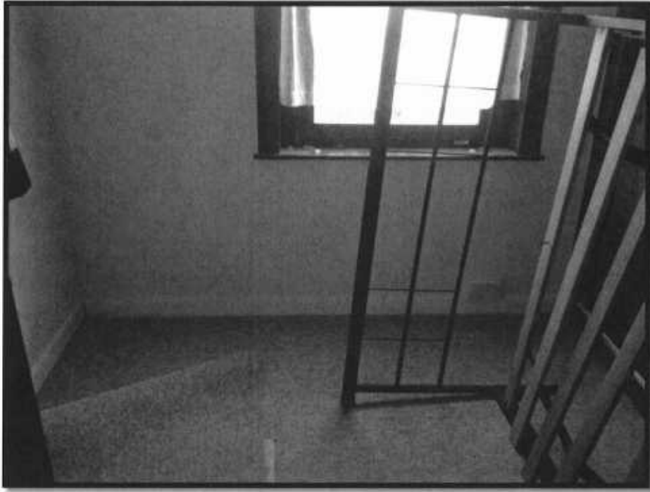
Figure 4 Front Bedroom wall