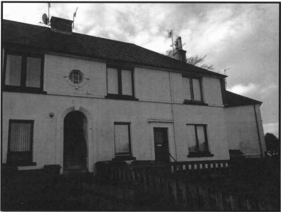
Figure 1 Front Elevation

Schedule of Photographs 55 Middlefield Place, Aberdeen AB24 4PN Case Reference Number PRHP/RP/15/0086 Date: 21/01/2016