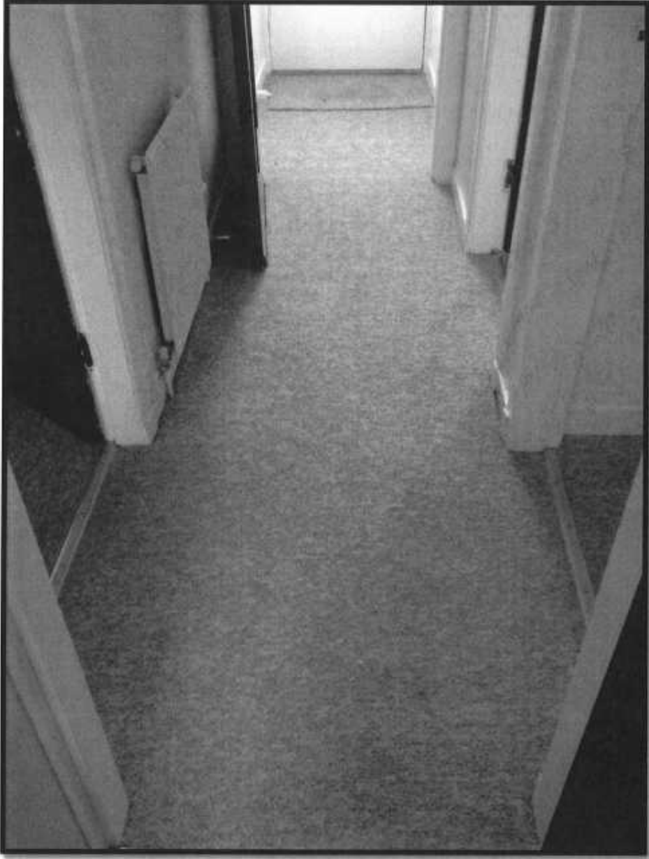
Figure 6 Hallway