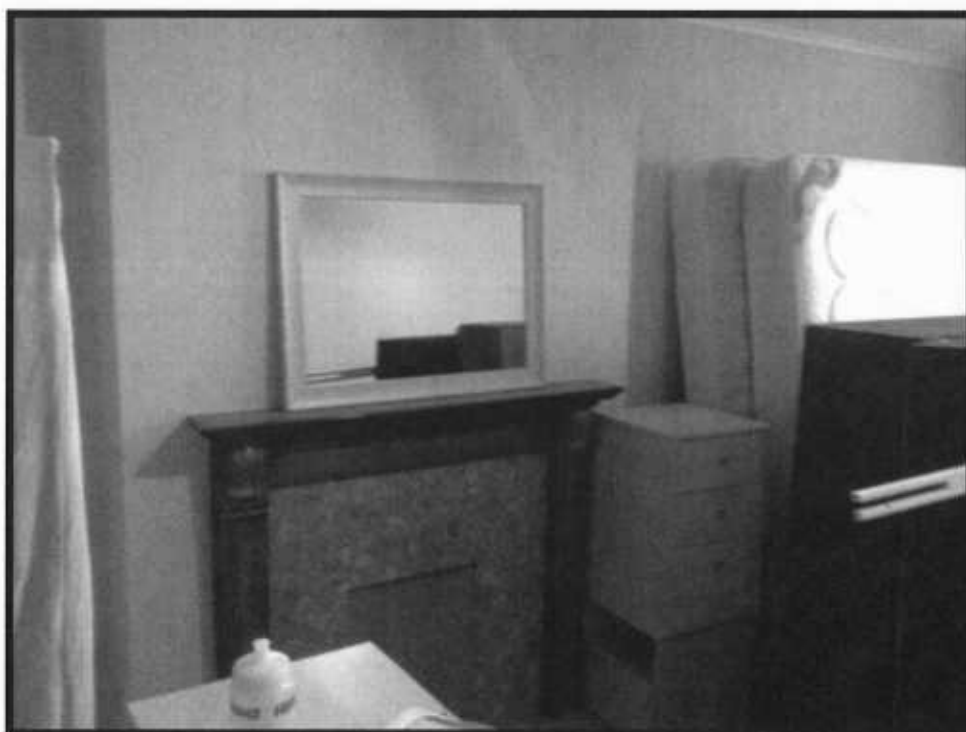
Figure 3 Gable wall and chimneybreast, Lounge