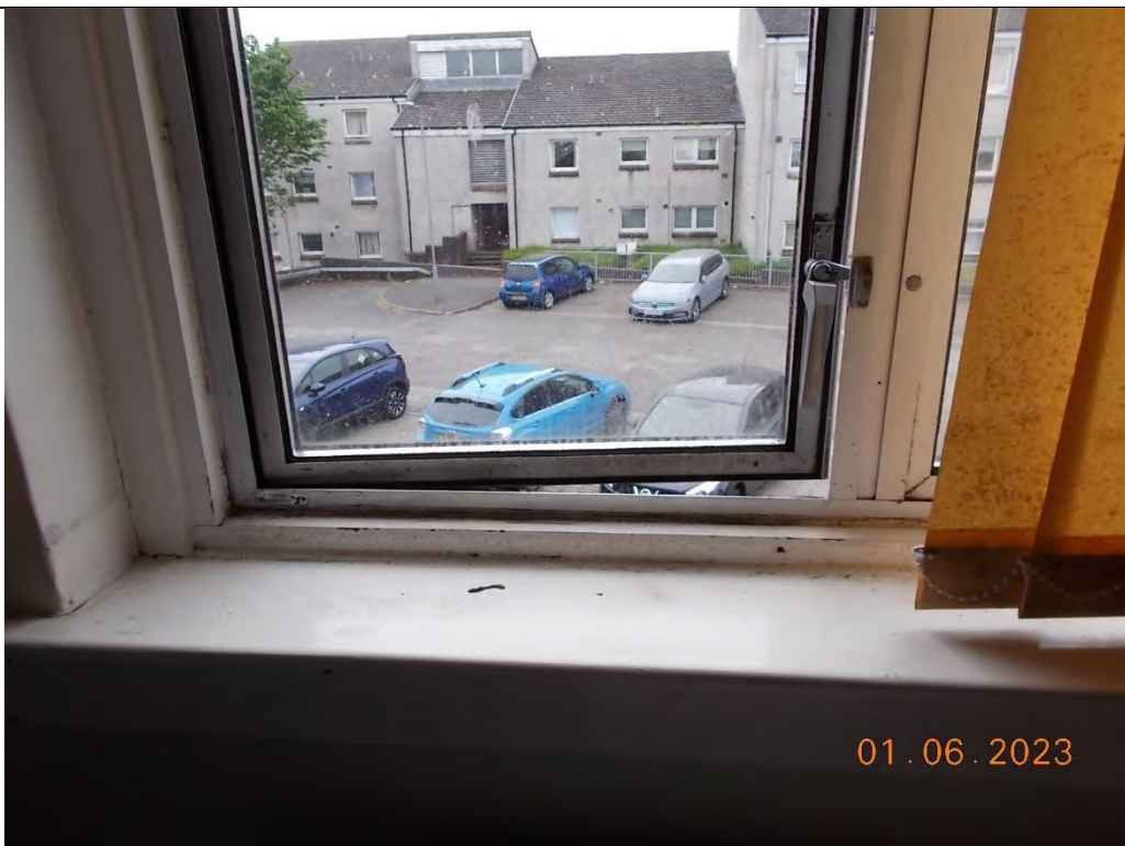
10. Window in "middle" bedroom.