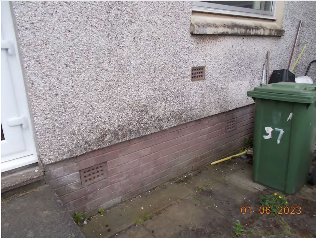
25. Visible air bricks to rear elevation intact.