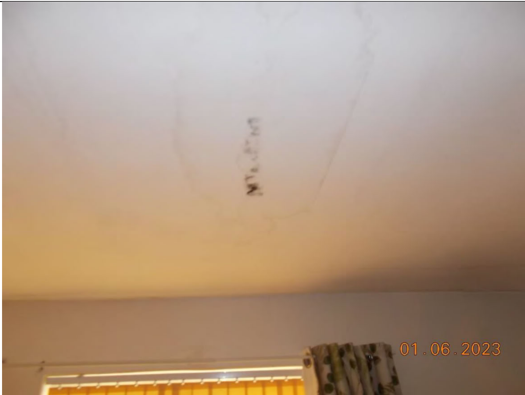
5. Damp stain and mould growth on ceiling of “middle” bedroom. Damp meter confirmed still damp.