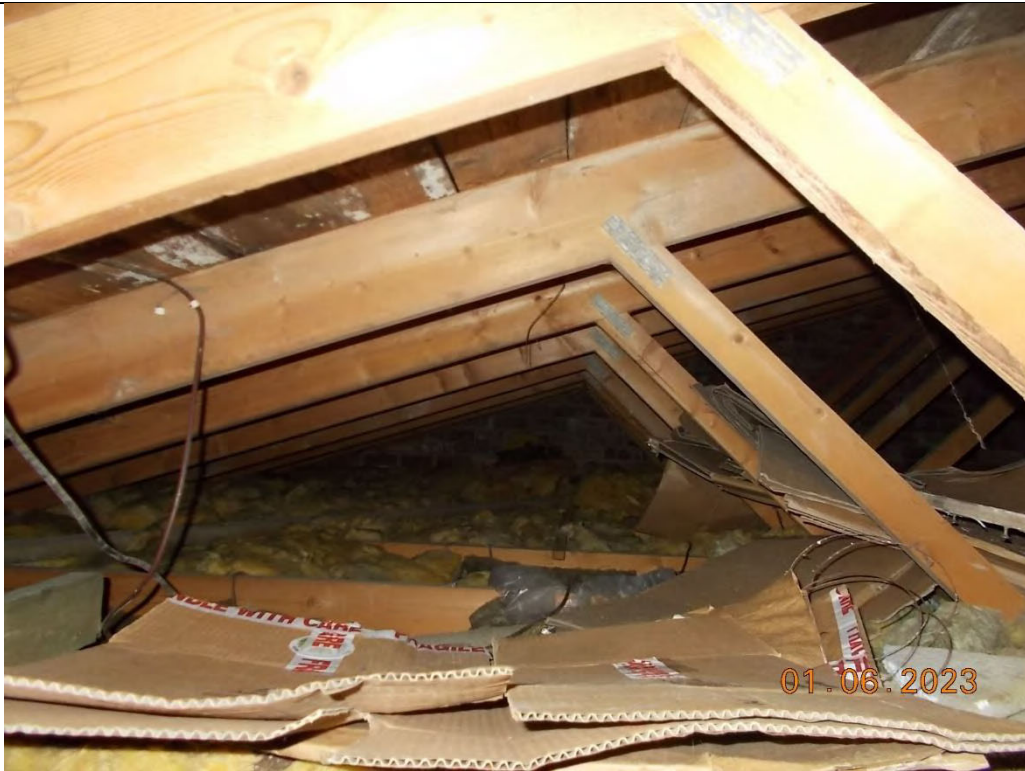
17. Roof void.