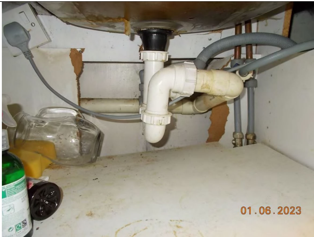
22. Pipework below sink in Kitchen. No current leak detected.