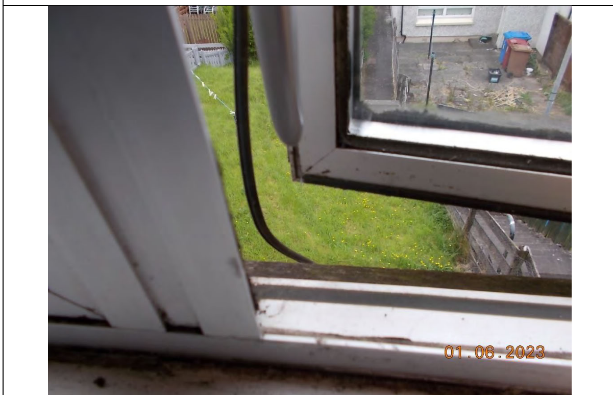
16. Window in "rear" bedroom. Loose sash seal.