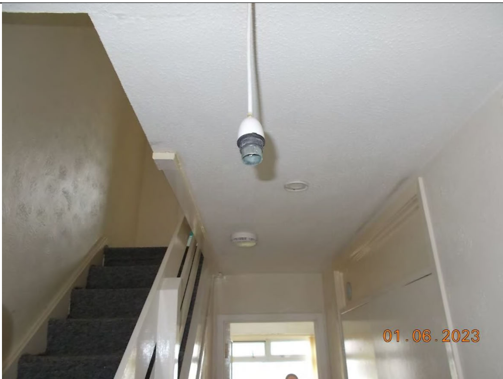
6. Bulb holder to light in lower hallway with missing ring to retain shade.