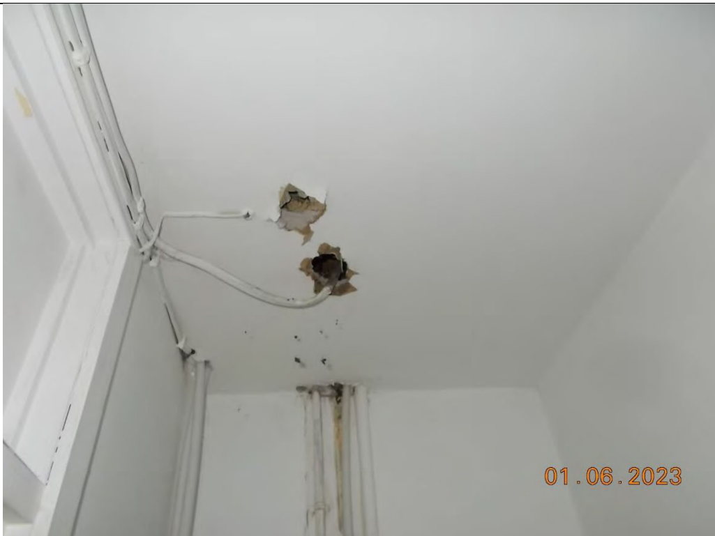
26. Holes in ceiling in cupboard off hall at ground floor level.