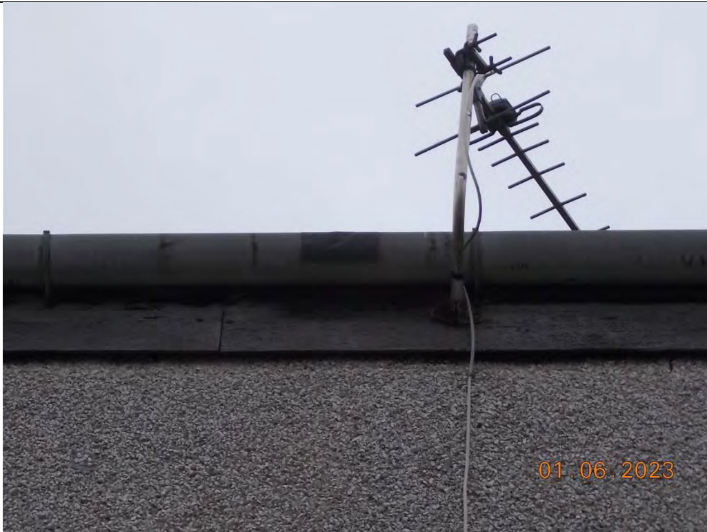
7. Patch on front gutter