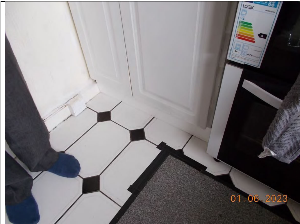
21. Kickboards in Kitchen