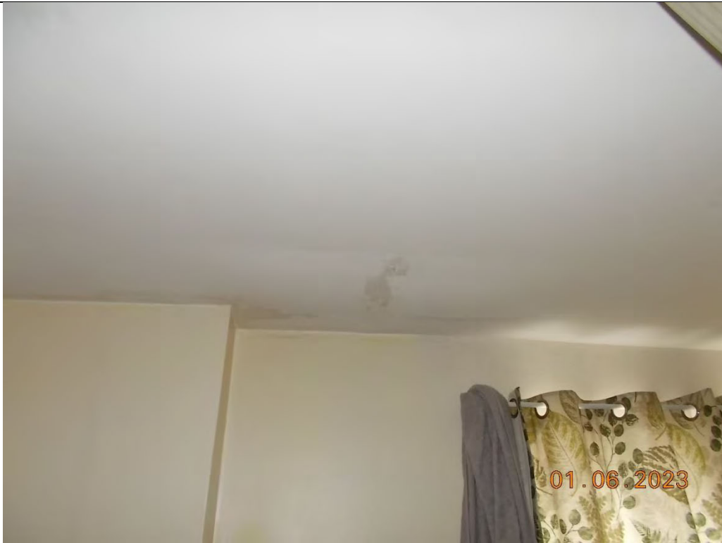
3. Damp stain on ceiling of “small” bedroom. Damp meter confirmed still damp.