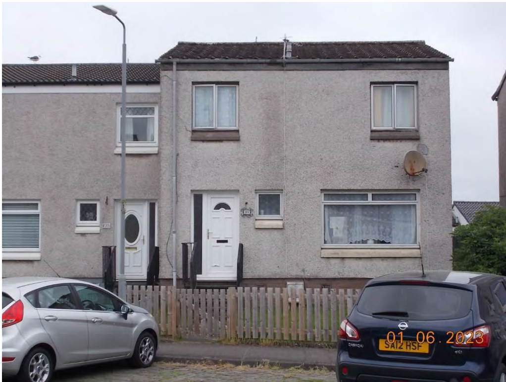
Street view / Front elevation

Property 37 Tiree Place, Hallglen, Falkirk FK1 2PP