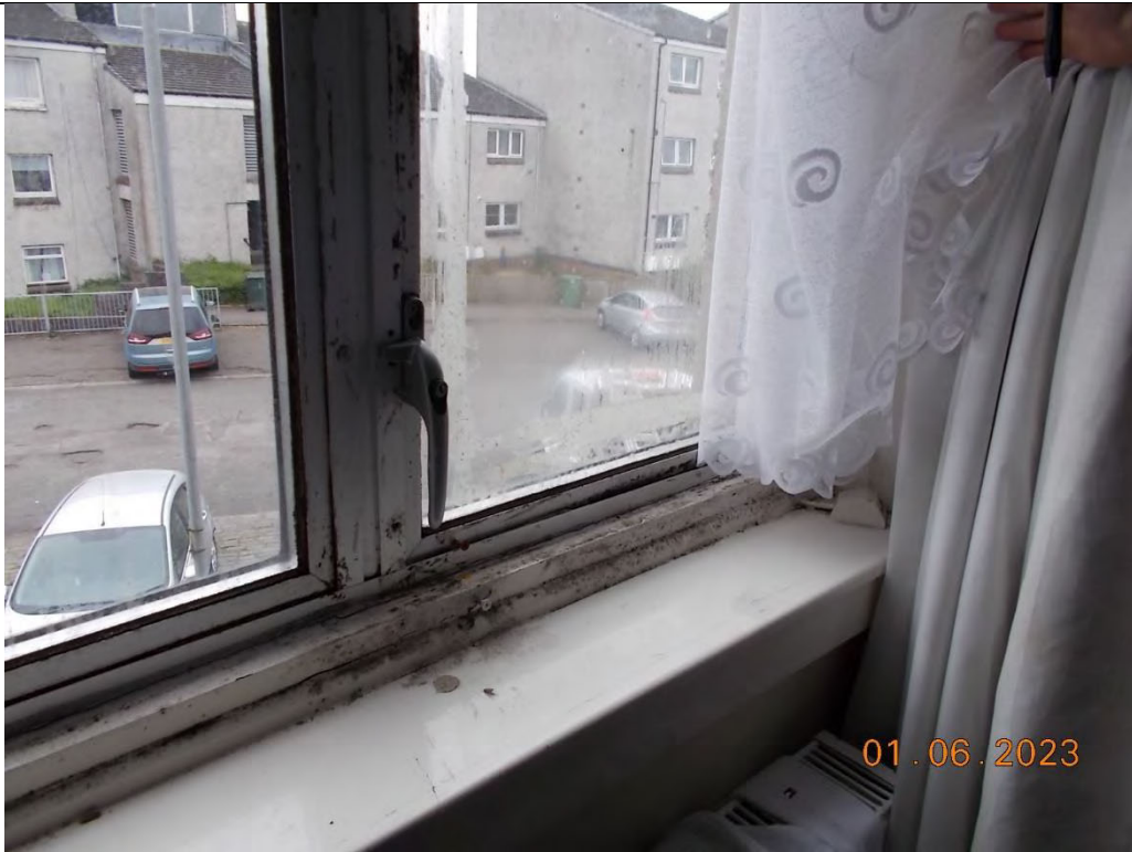
13. Window in "small" bedroom.