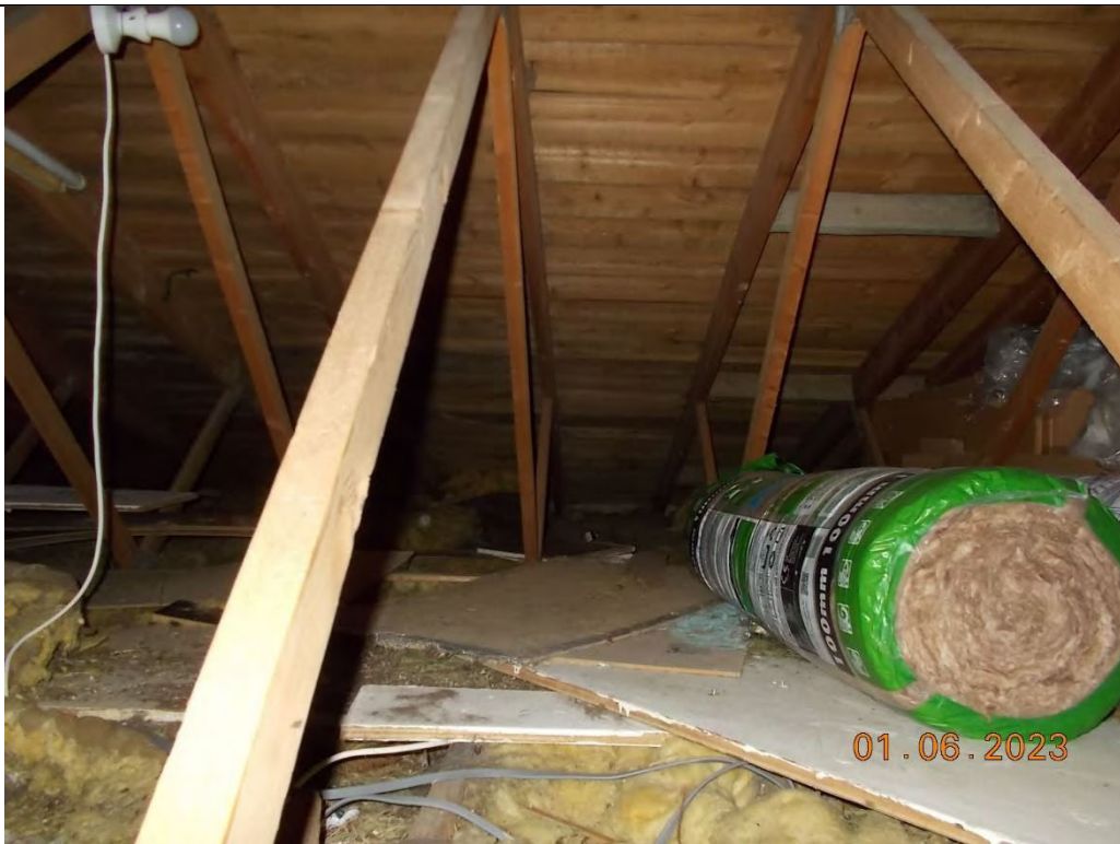
18. Roof void.