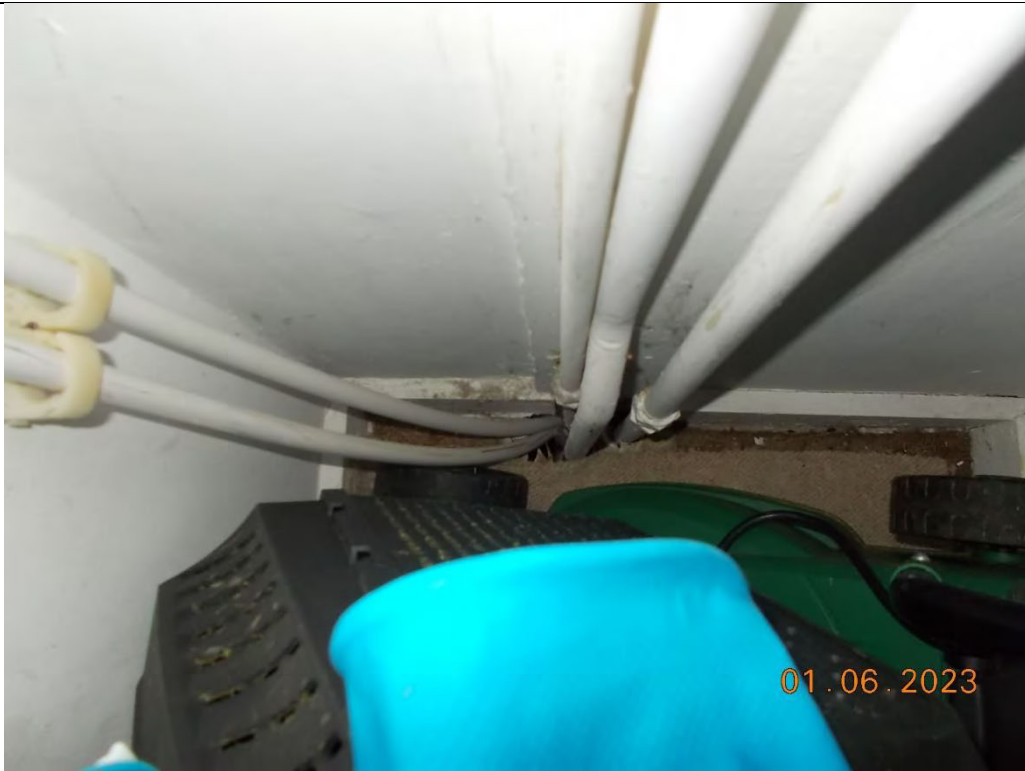
27. Gaps in floor around pipes in cupboard off hall at ground floor level.