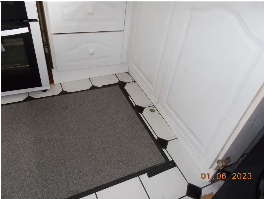
20. Kickboards in Kitchen