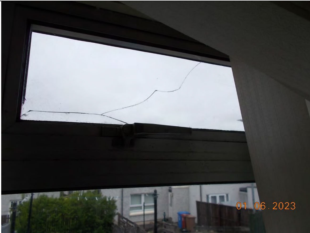
9. Cracked sealed double glazed unit in Kitchen window.