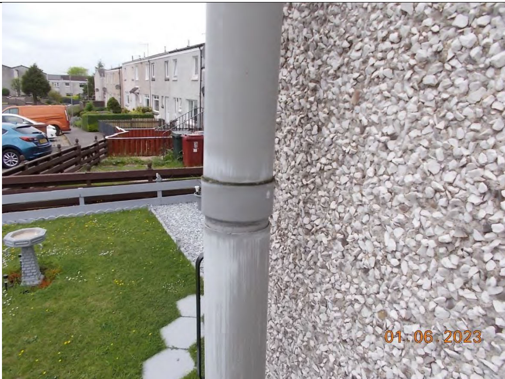
8. Joint on front downpipe