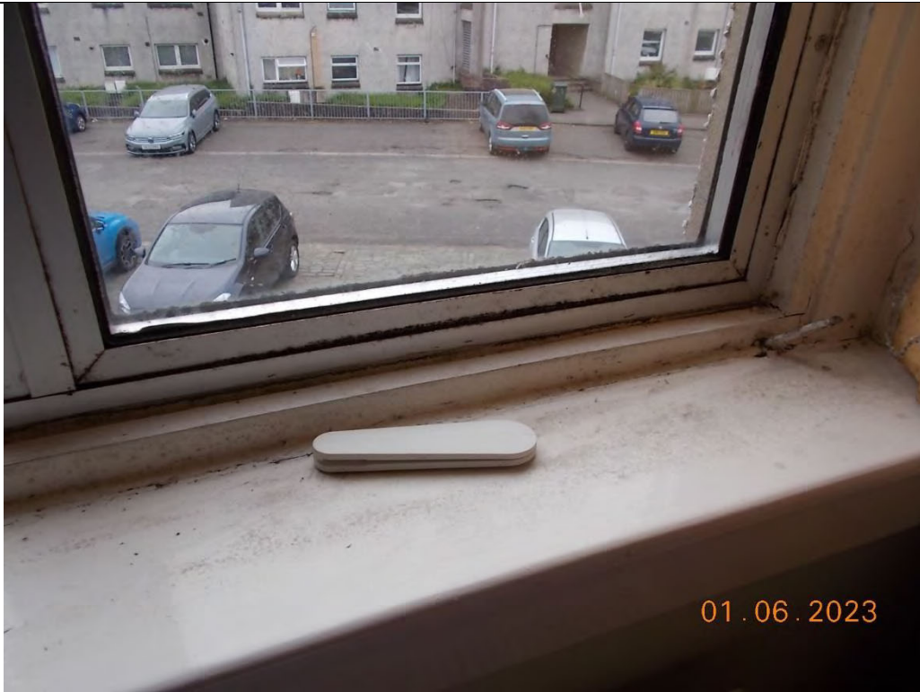
11. Window in "middle" bedroom.