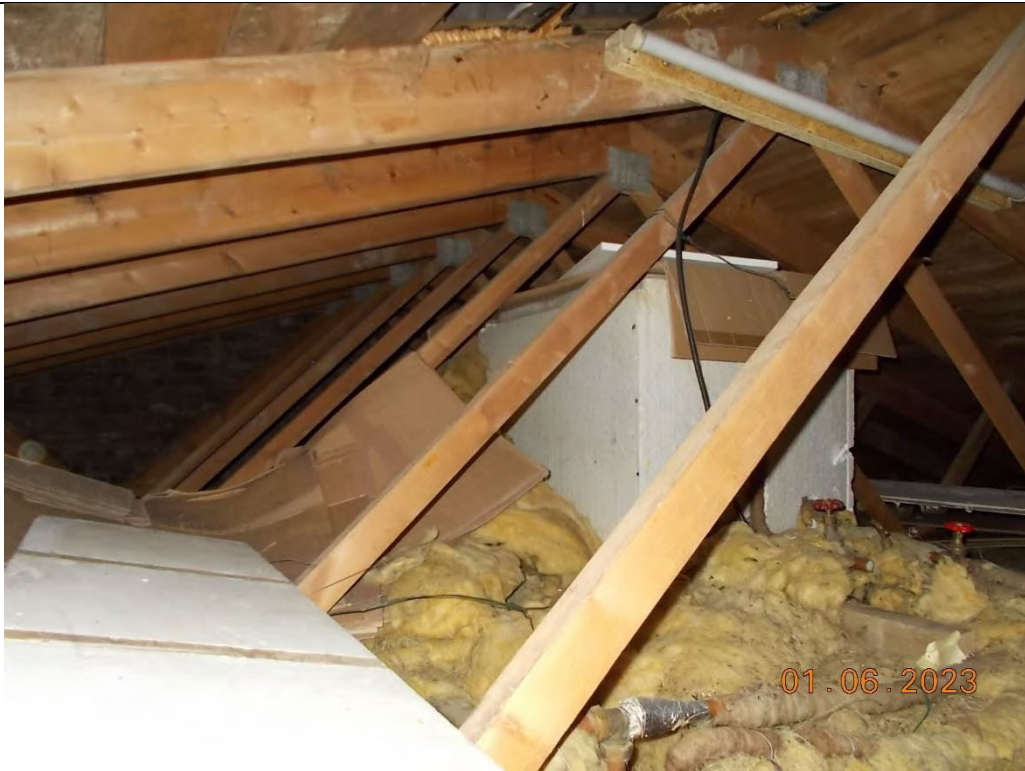
19. Roof void