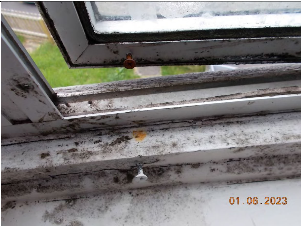
14. Window in "small" bedroom.