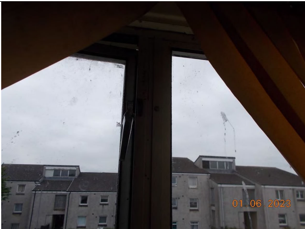
12. Window in "middle" bedroom.