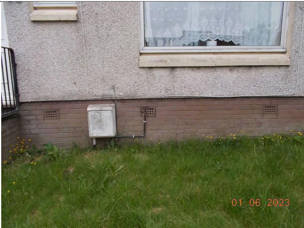
24. Other airbricks to front elevation intact.