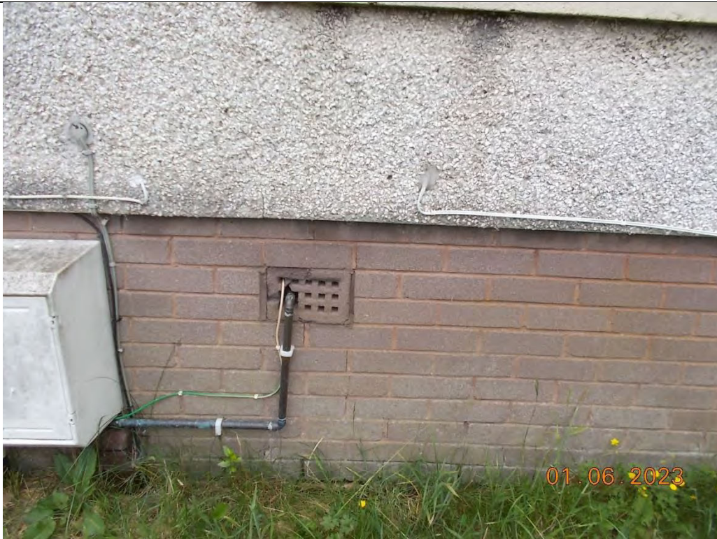
23. One airbrick on front elevation damaged by gas supply pipe passing through.