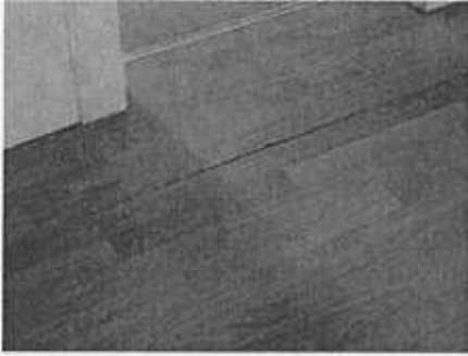
14. LR flooring