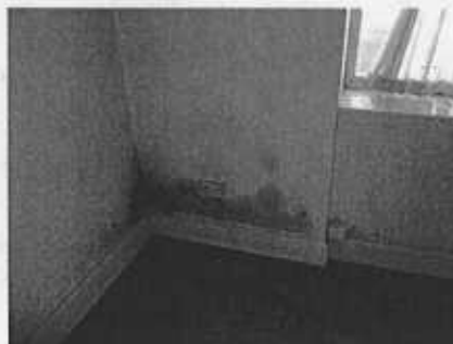
3. Mould at bedroom