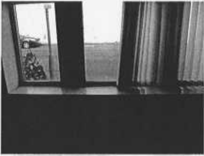
5. Mould at window