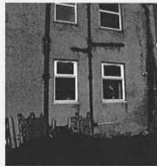
18. Rear elevation