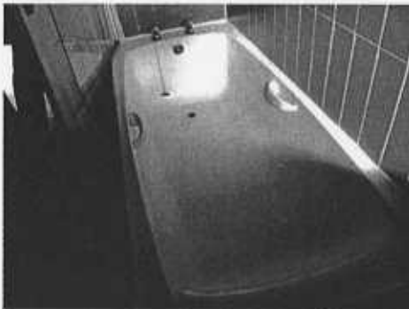
17. Bath drainage