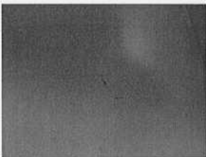
11. Plaster cracking wall