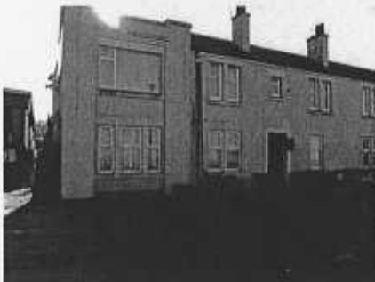
2. The property