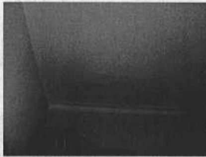
9. Plaster cracks ceiling