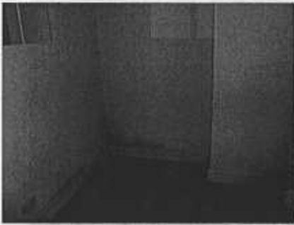
8. Mould at bedroom