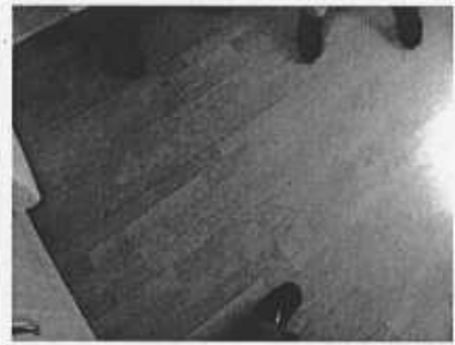
16. Kitchen floor