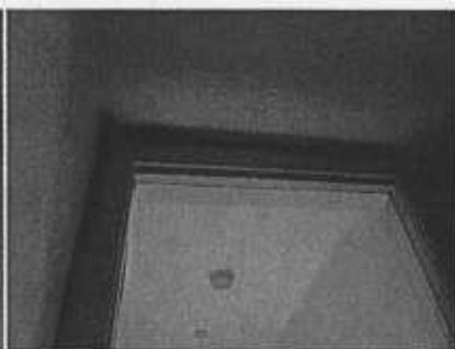
12. Plaster crack at door