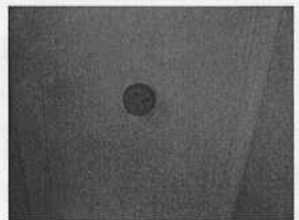
13. Hard wired smoke alarm