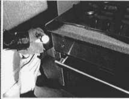
15. Loose grill/oven control