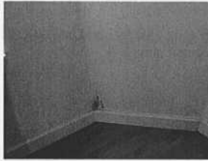
6. Mould at bedroom