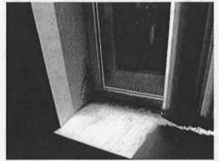
7. Mould at window