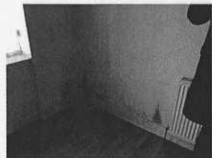
4. Mould at bedroom