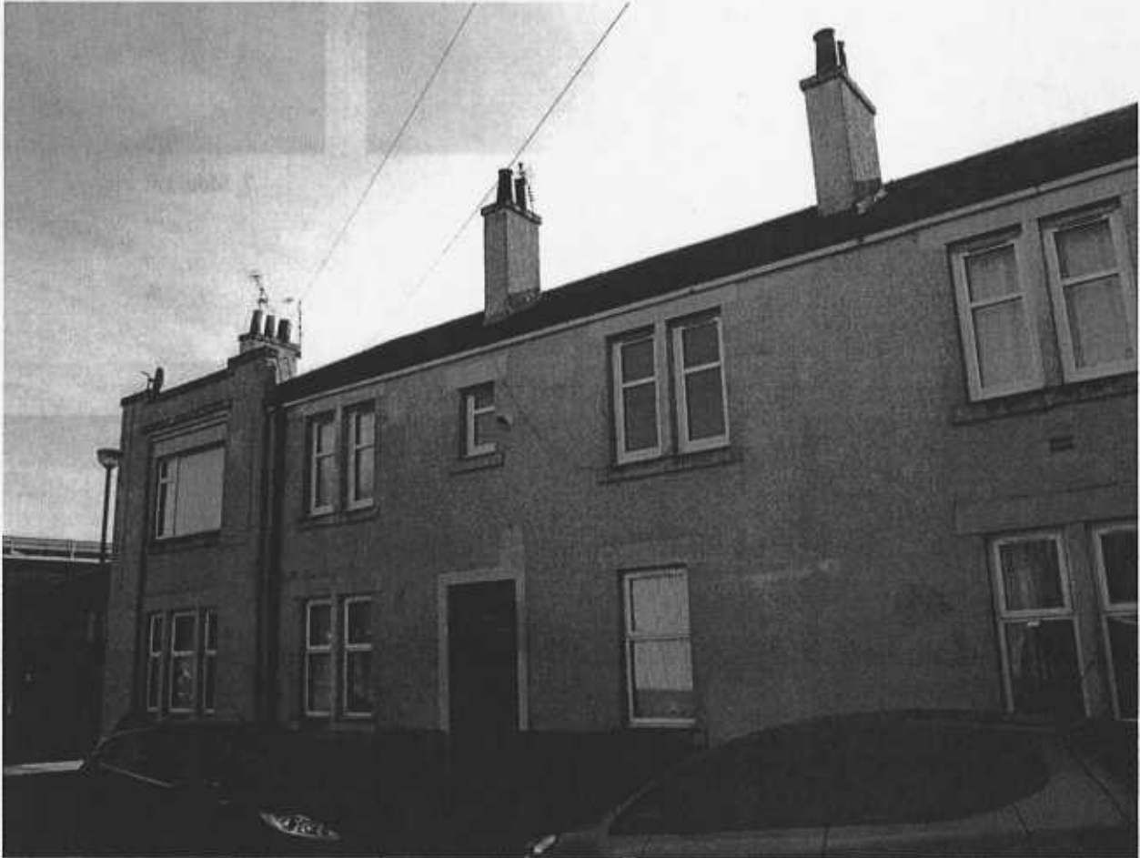
1. The property

Flat 0/1 329 Bogmoor Road, Glasgow, G51 4SJ PRHP/RP/15/0265 Schedule of Photographs - Inspection Date 14/03/16 Weather – Clear, dry and sunny