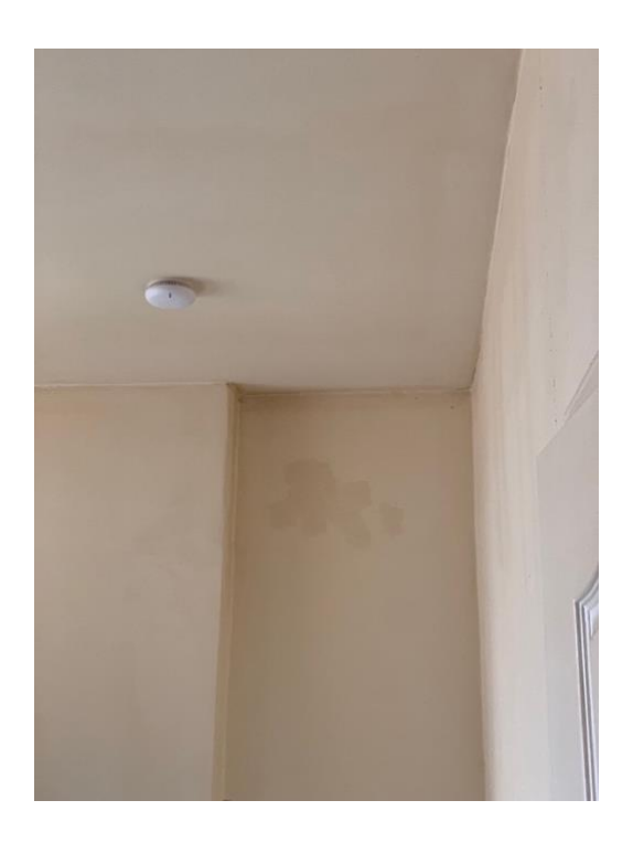
Photograph 2: Living room – smoke detector