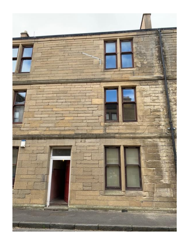
Photograph 1: Front elevation (ground floor)