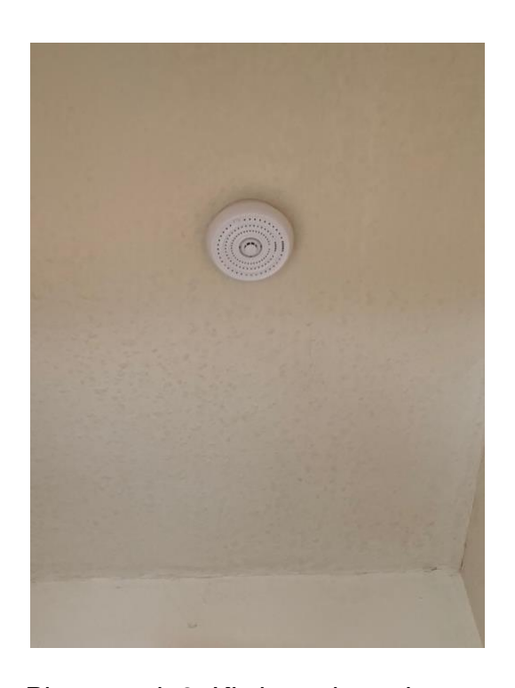
Photograph 3: Kitchen - heat detector