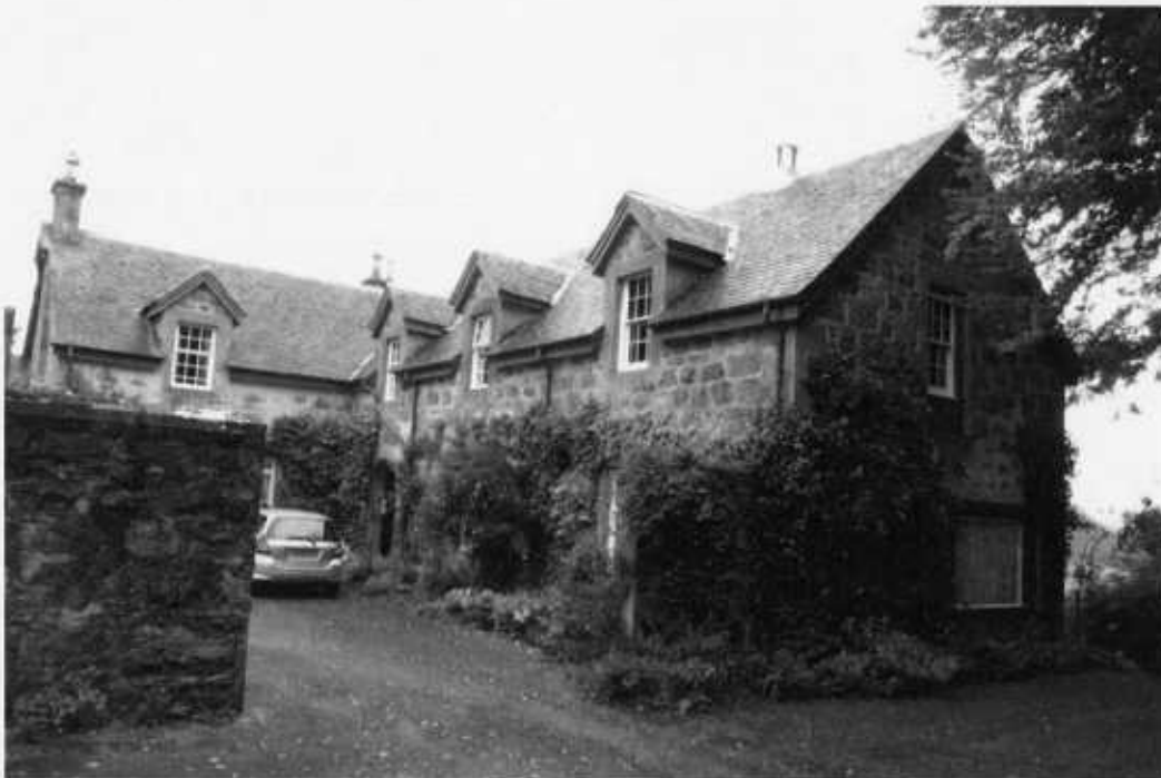
Photograph of property on 6 th October 2015

Repairing Standard Enforcement Order (RSEO) dated 20 th October 2015