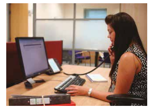
A member of prhp staff answering a call

Every Panel member and every member of staff is fully committed to providing the best possible service we can to all who come to us, no matter what their gender, sexual orientation, race, ethnicity, religion or belief, age, relationship status or physical or mental ability. We will do all that we can to make our service efficient, accessible and user-focused.