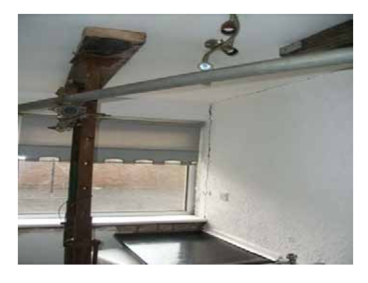
Kitchen looking to rear showing propping and cracks at the wall and ceiling