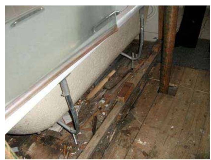
Bathroom looking to hall showing propping and cracking