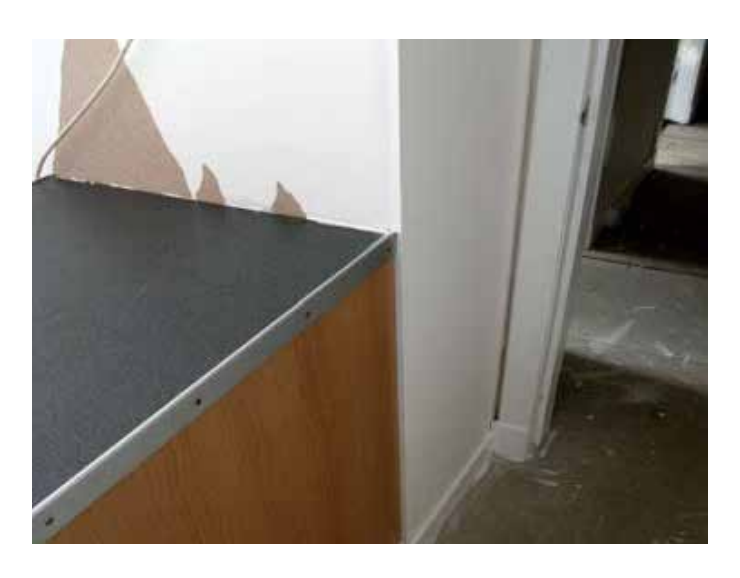
Kitchen showing lower wall at corner