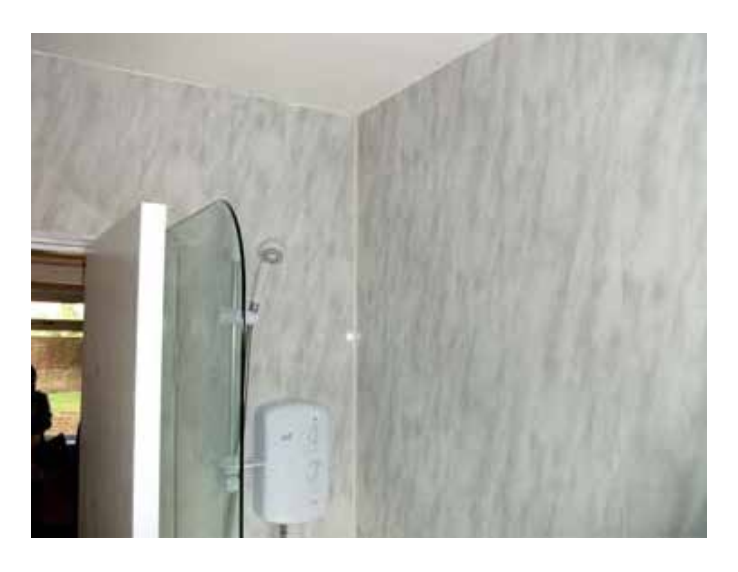
Bathroom looking to hall