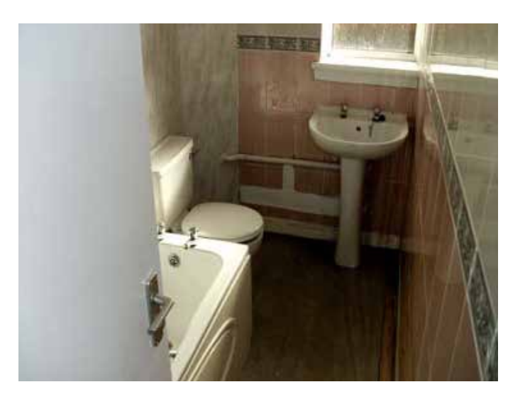
Bathroom from hall