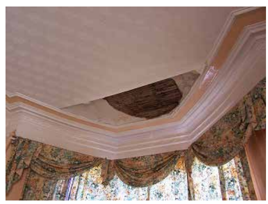
Damage caused by roofing issue at a property

Before making such a decision, the President or the Committee will look at all the circumstances of the case, and in particular whether the repairs alleged in the application may give rise to health and safety issues for future occupants.