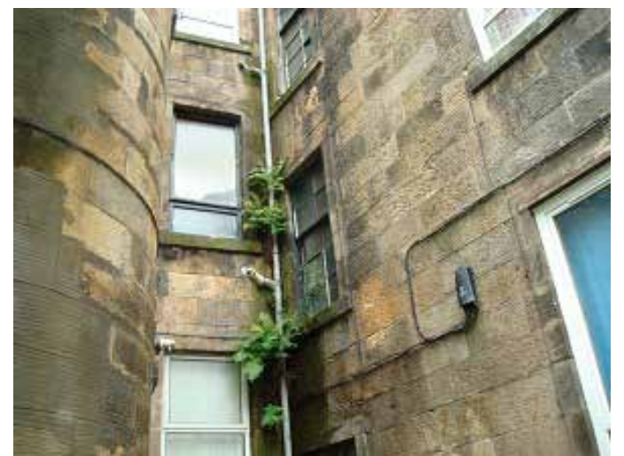
Condition of properties at time of inspection

Prior to the inspection and hearing, the Committee can manage the progress of the case as it considers appropriate in the circumstances. It may issue one or more written directions to the parties relating to the conduct or progress of the case. It may, for example, require the parties to provide further information or documentation to the Committee – such as requiring the landlord to produce a gas safety certificate or an electrical inspection report or provide for a particular matter to be dealt with as a preliminary issue.