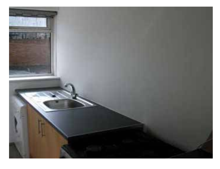
Kitchen looking to rear