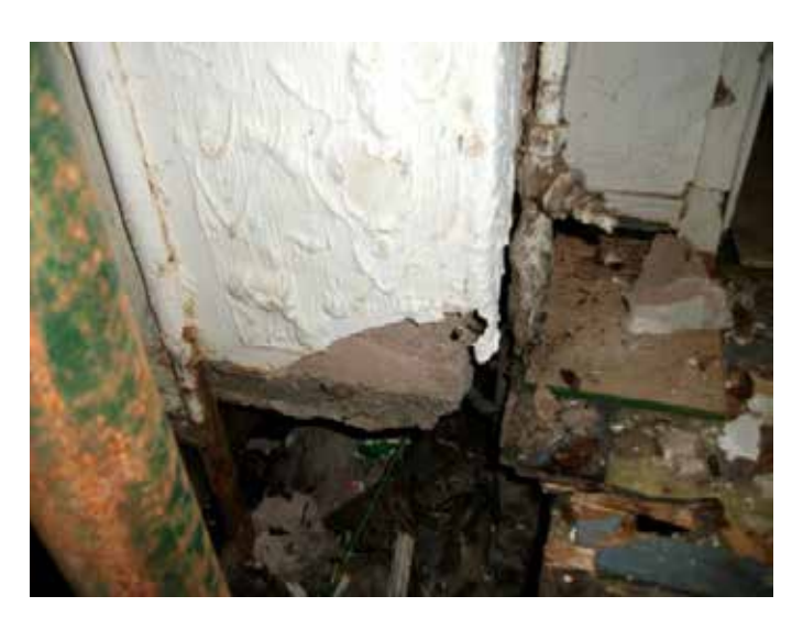
Kitchen showing lower wall at the corner