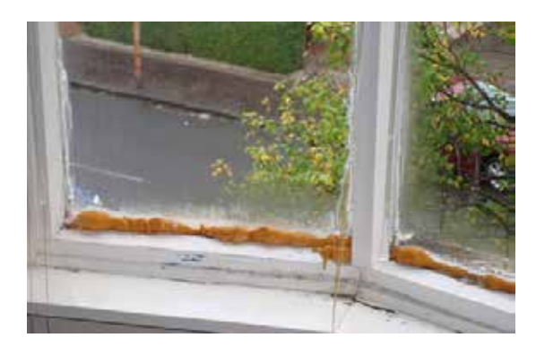
Window defects at a property at time of inspection

In determining whether a house meets that repairing standard, the age, character and prospective life of the house and its locality can be considered. Common