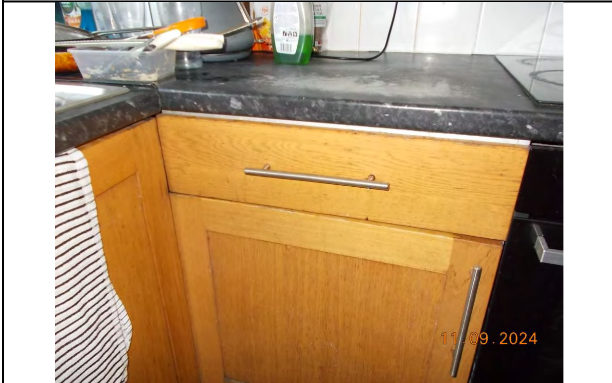
5. Kitchen drawer next to sink