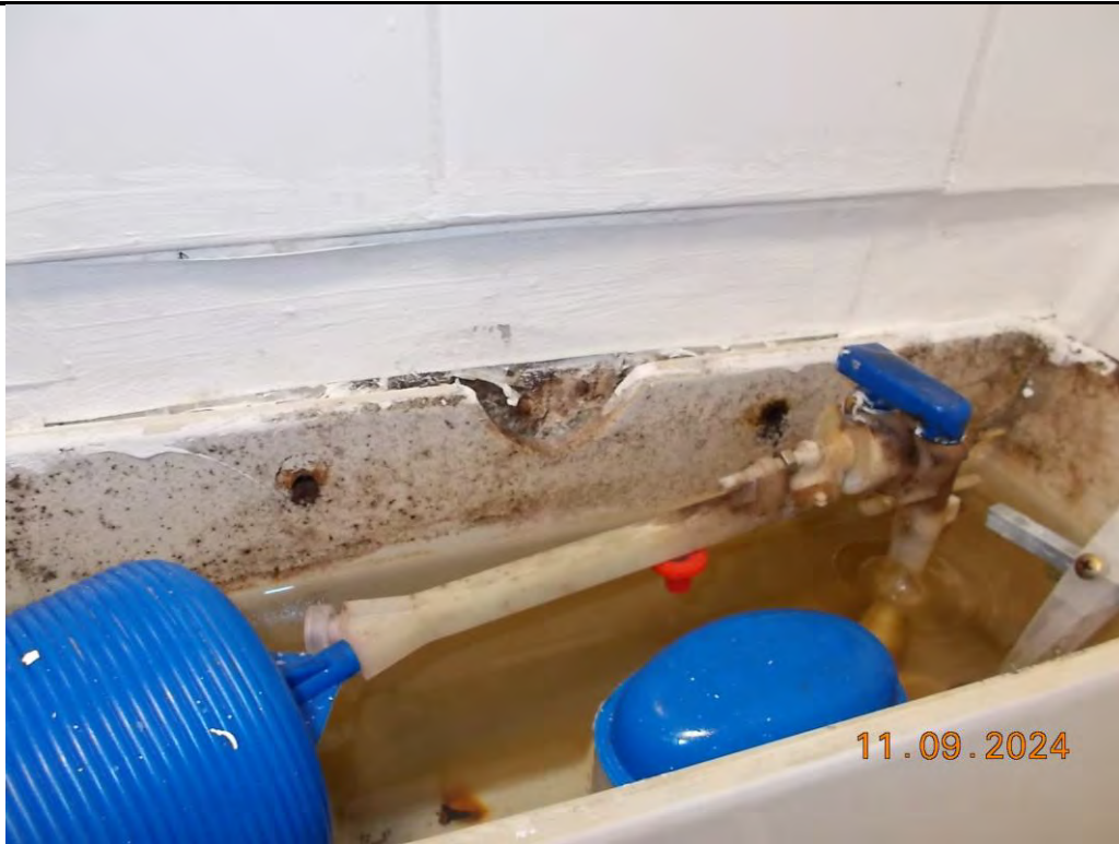
9. Cistern to WC in Bathroom