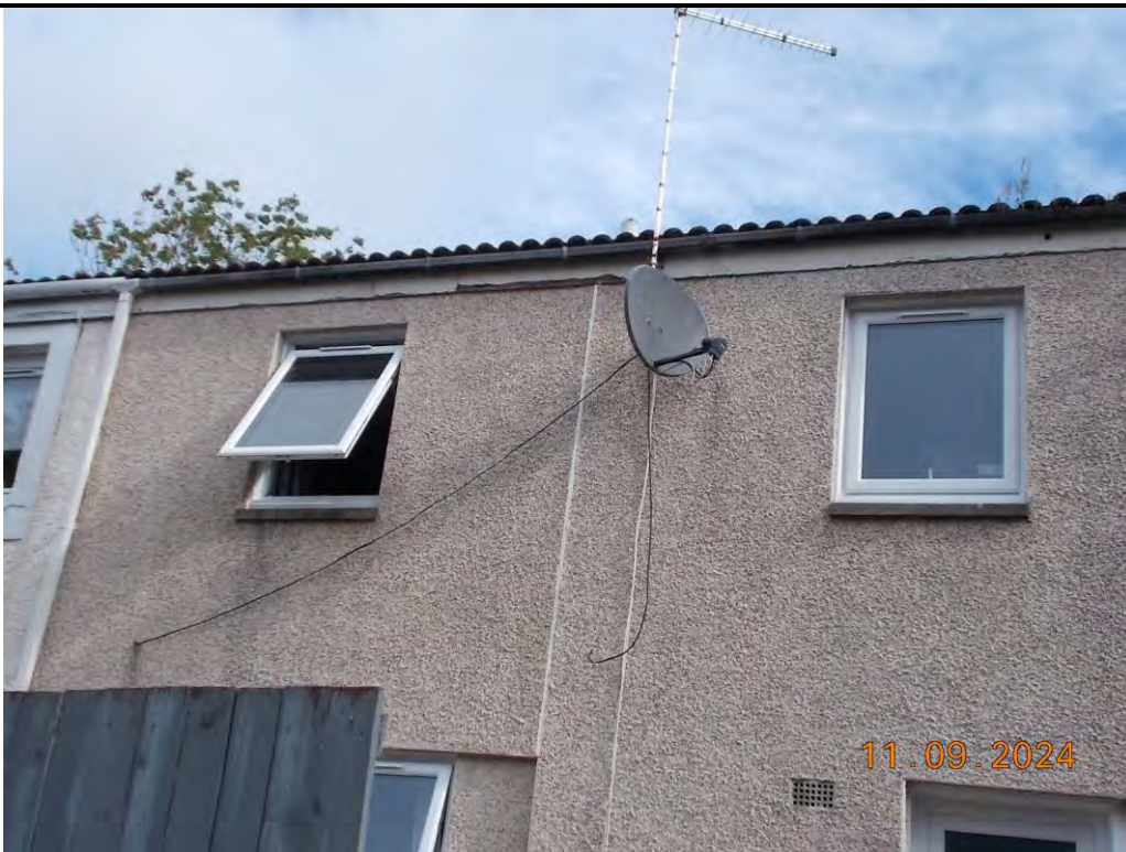
16. Fascia to front of property