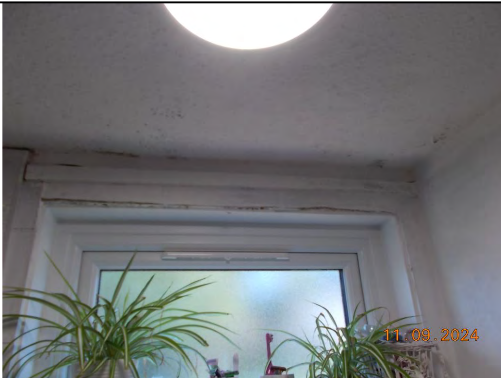
10. Staining above window in Bathroom