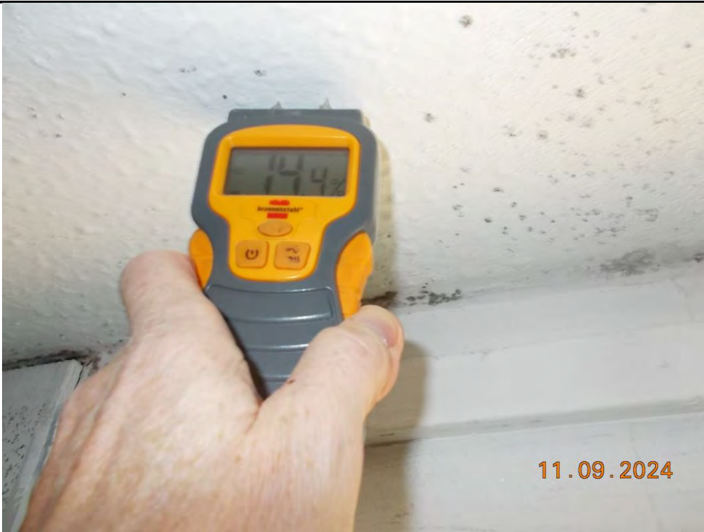
11. Meter reading in stained area above Bathroom window