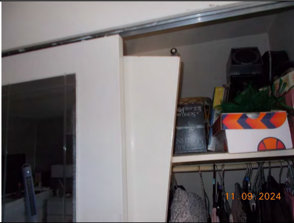
13. Sliding wardrobe doors in Bedroom2