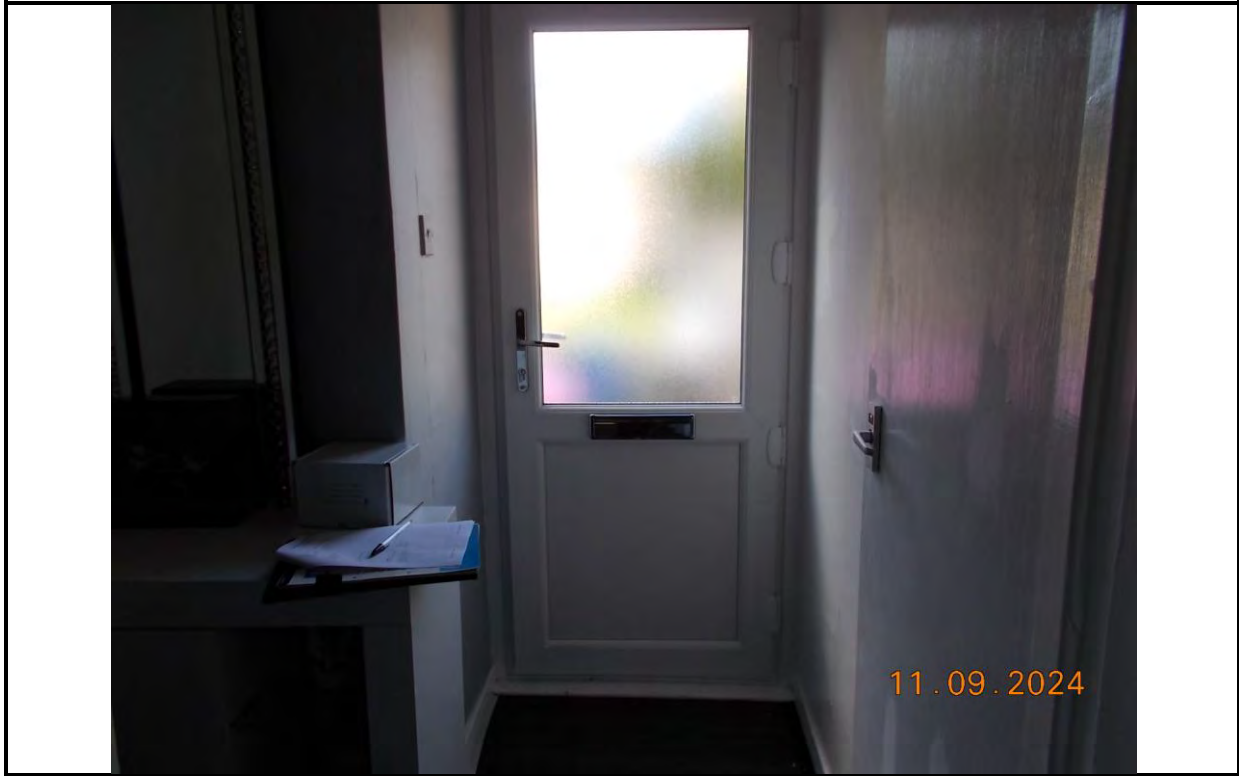
2. Front external door from inside