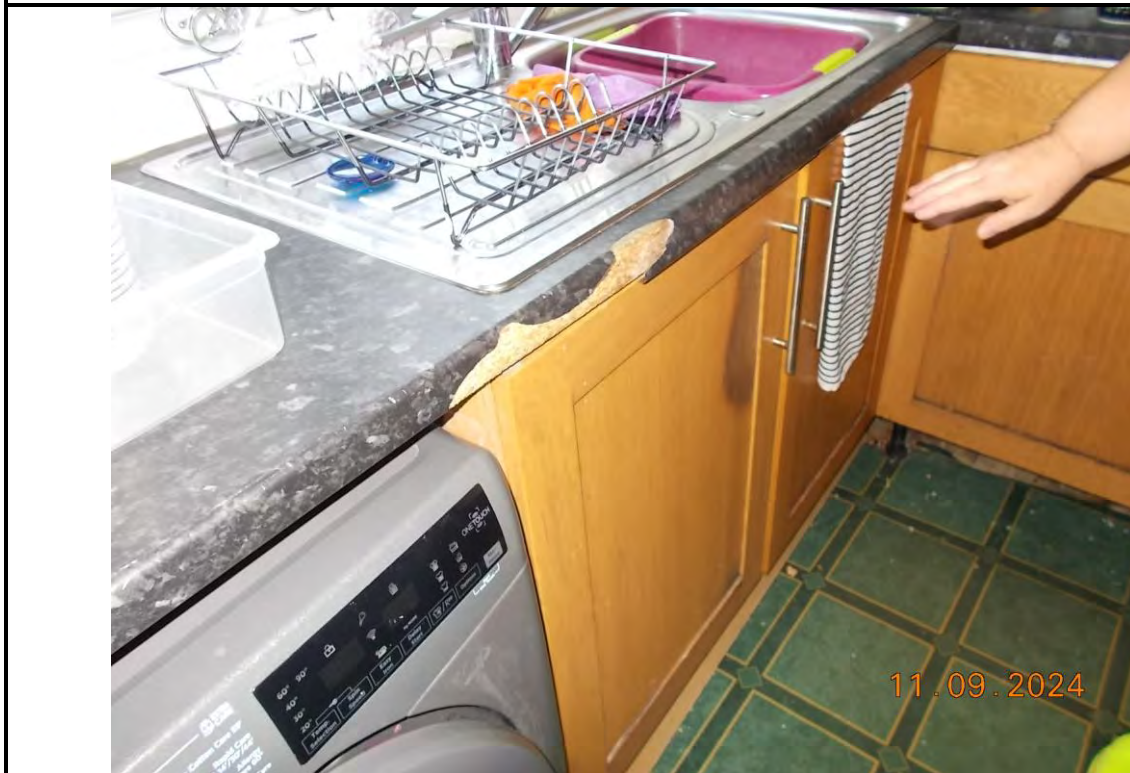
4. Kitchen worktop