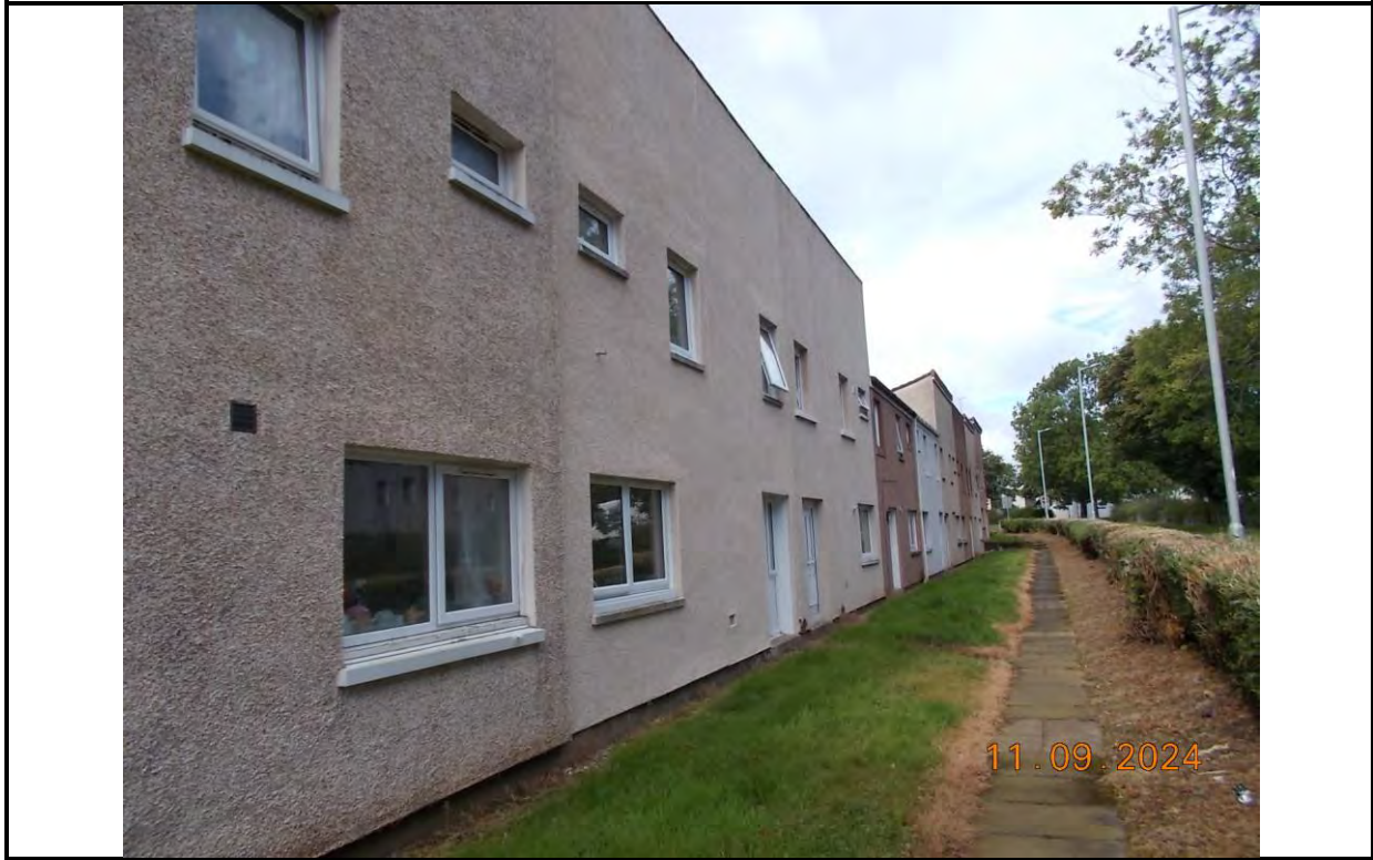
17. Rear elevation of property