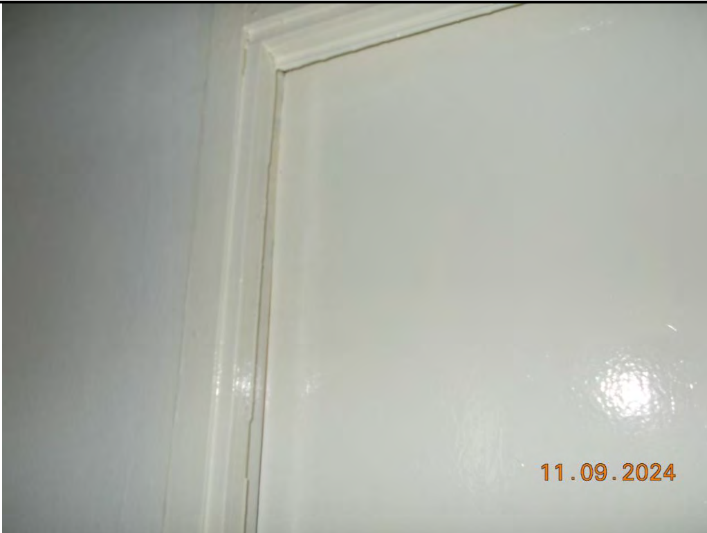
12. Bathroom door from landing