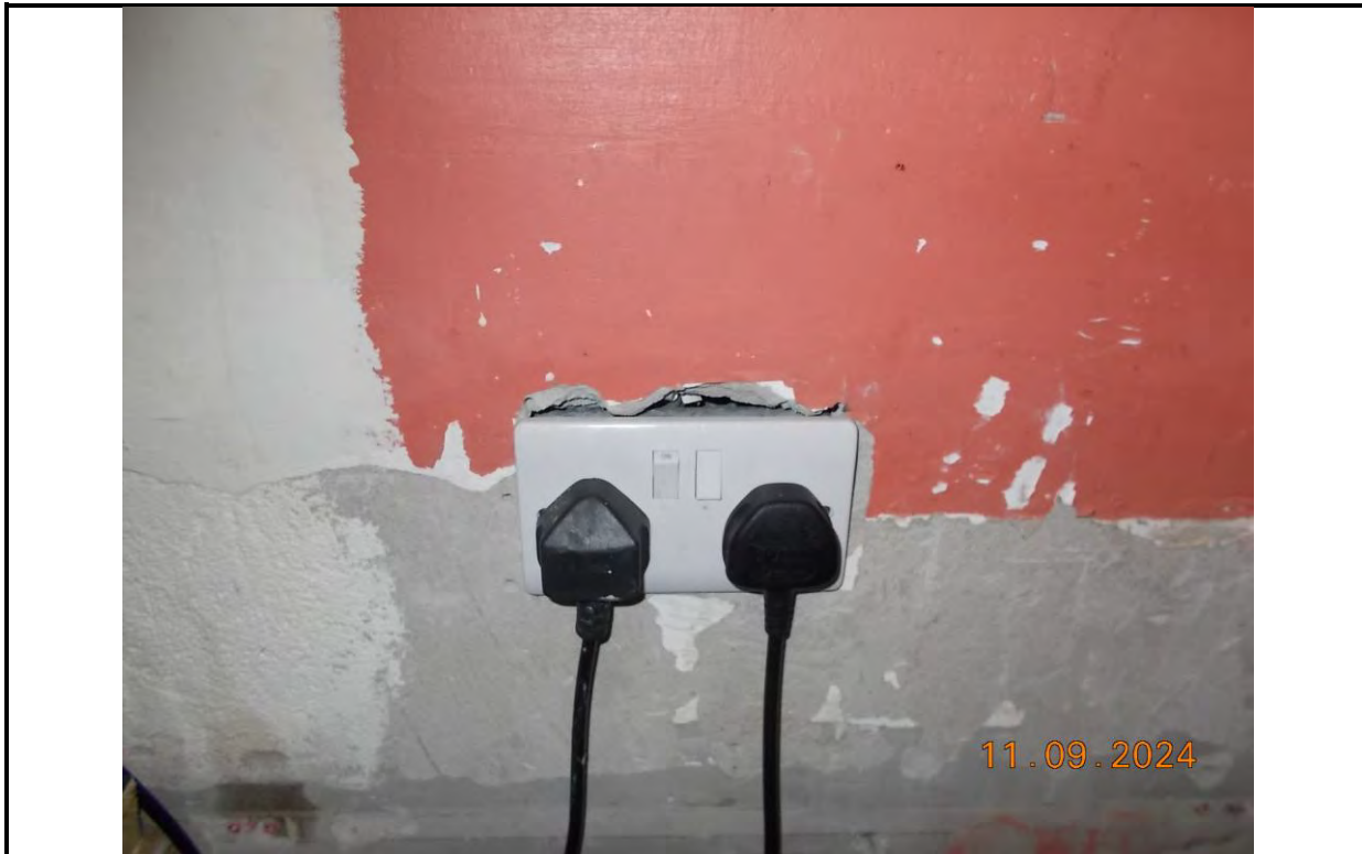
7. Repaired double socket outlet in Kitchen