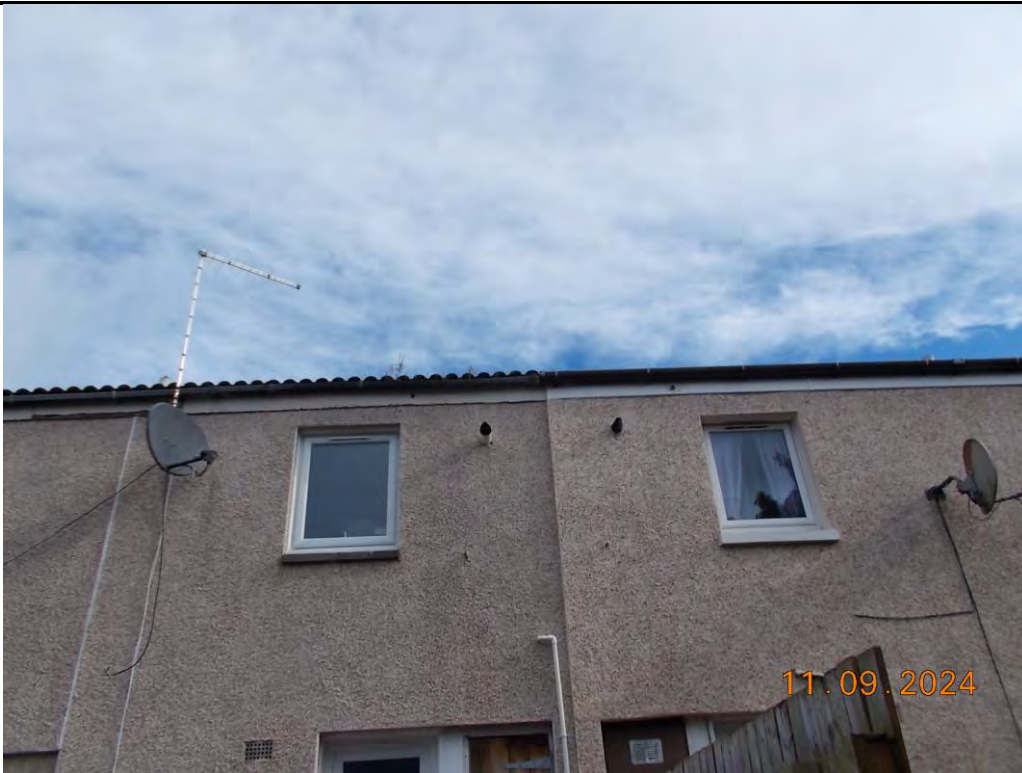
15. Gutter to front of property