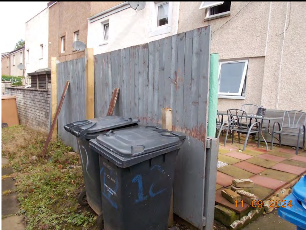
14. Fence to front of property