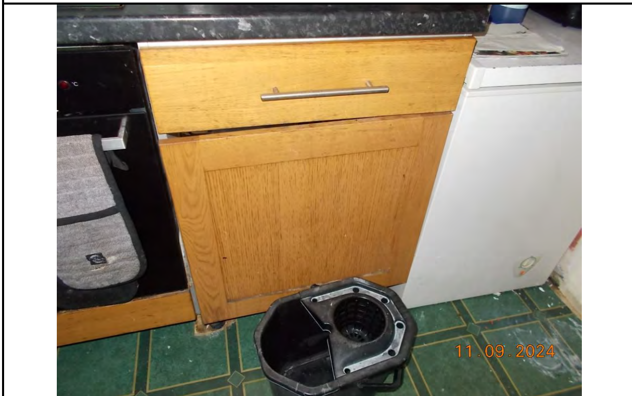
6. Kitchen base unit door next to cooker